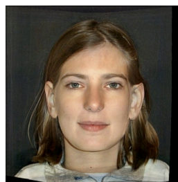
Girl at age 30